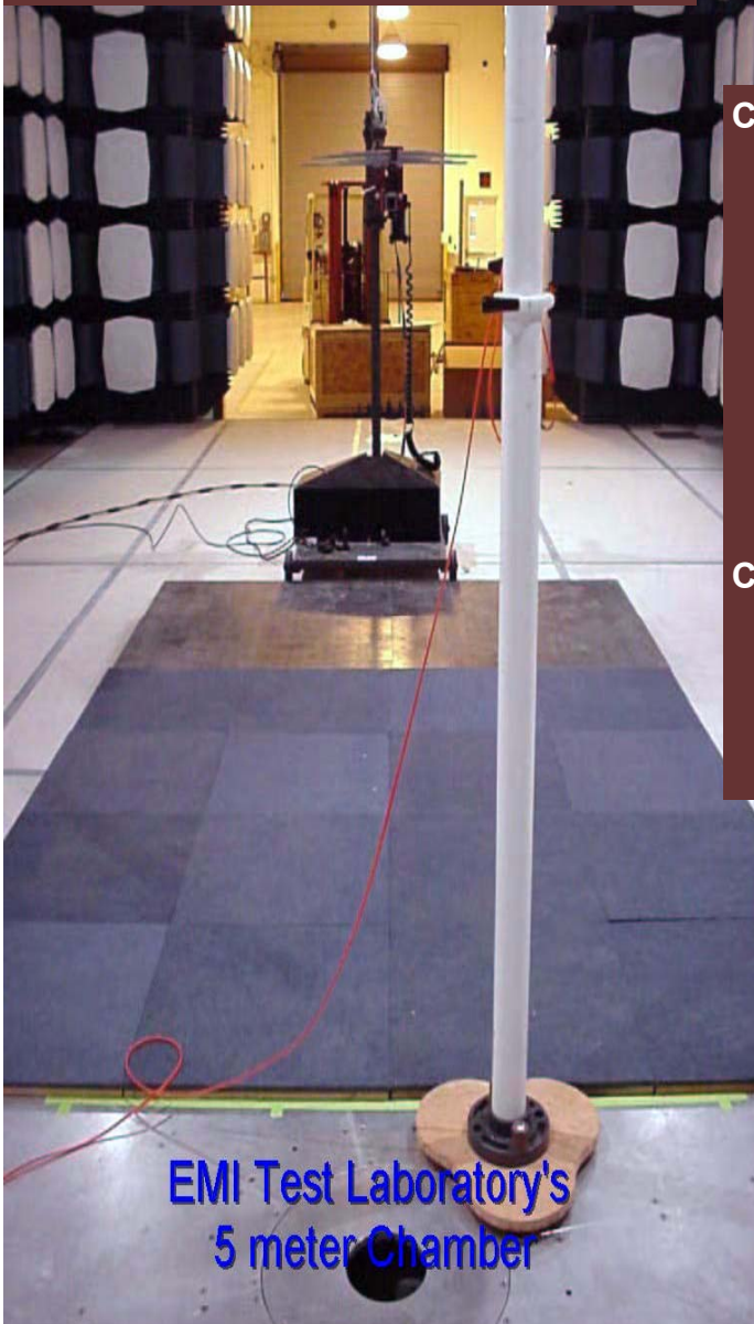
EMI Test Laboratory's 5 meter Chamber